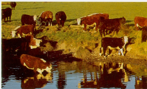
Fertilizing pastures with sulphur can enhance ruminant performance.